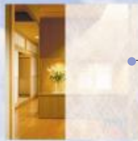
Sagano: subtle crosshatch pattern creates an icy illusion Product size: 50" x 98.4'

At a fraction of the cost of etched-glass, Fasara films are perfectly suited for interior glass partitions or the inside surface of windows. Available in several textures which can be die-cut for highly customizable designs, Fasara films can be used to create a more private atmosphere or a more dynamic aesthetic.