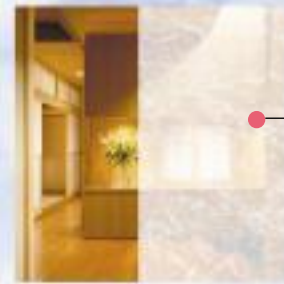
Yamato: a highly textured, rice-paper styling Product size: 50" x 98.4'