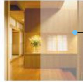
Oslo: creates a masking, slightly textured fog Product size: 50" x 98.4'